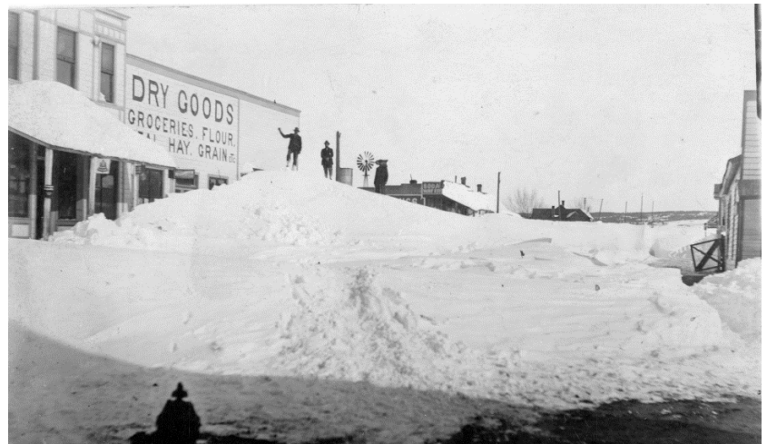
Above: In The Communities of the Palmer Divide , this photo is described as follows: Several unidentified people stand on a 20-foot snowdrift in front of Higby's store [in Monument] after a 1913 storm that struck in early fall.

On April 17, 1900, the Denver Post report states that "at Palmer Lake . . . the drifts are 20 feet in height." At this time, the D&RG, SF, and C&S all had trains stuck or had to cancel service originating in Pueblo or Denver.