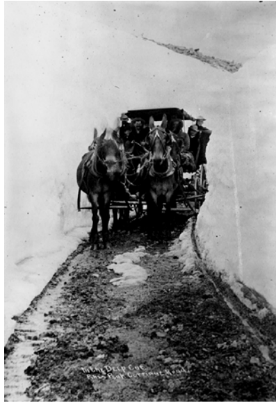
Above: Although not a Palmer Divide photo, In the Deep Cut on Pikes Peak Carriage Road is breathtaking in depicting the amount of snow that had to be dealt with.

Photo courtesy of Pikes Peak Library District, No. 013-418