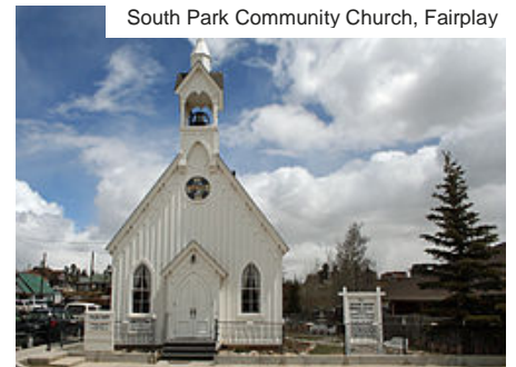
South Park Community Church, Fairplay