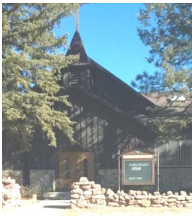
Monument Presbyterian Church

included pictures of places in the West. Ultimately Jackson supervised the building of churches in at least twenty-two Colorado locations, including Greeley, Colorado Springs, Pueblo, Monument, Ouray, and Fairplay. During his career he travelled about one million miles and established more than 100 missions and churches.