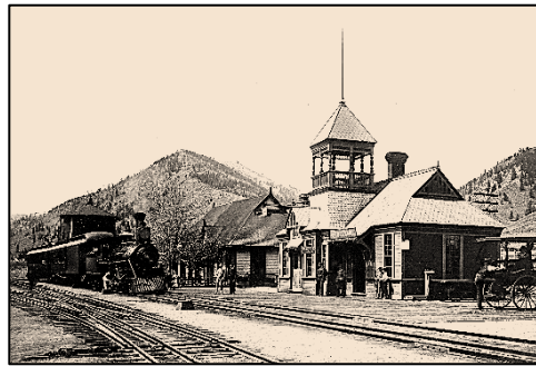
D&RG Depot (left) and Judd Eating House ca 1894 (left and below)