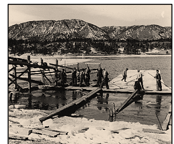
Above: Monument Creamery (left) and Ice Harvest on Monument Lake (right)