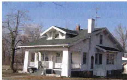
Above: Sears, Roebuck & Co. "Bandon" model kit house in Pulaski, IL

Between 1908 and 1940, Sears shipped 70,000 kit houses across America in railroad boxcars, and many still survive today.