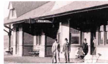
Santa Fe Depot and enlarged sign ca 1887