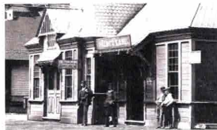
D&RG Depot and enlarged sign ca 1894